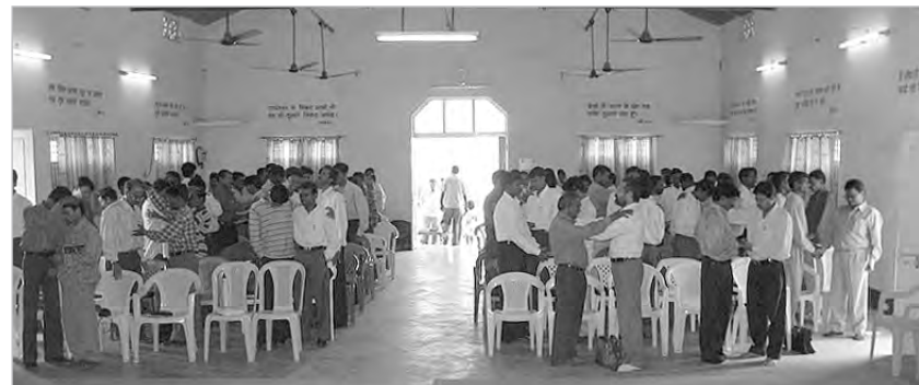
Praying for one another at the conference.