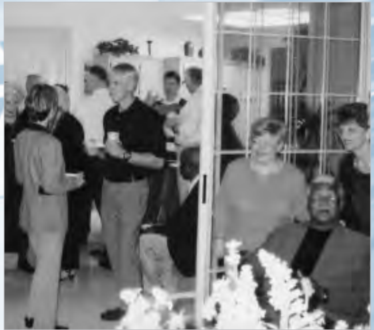
At the reception.